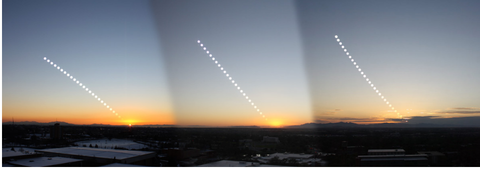
FIG. 2. Three overlaid sequences of photos of the setting sun, taken near the December solstice (left), September equinox (center), and June solstice (right), all from the same location at 41^\circ north latitude. The time interval between images in each sequence is approximately four minutes.